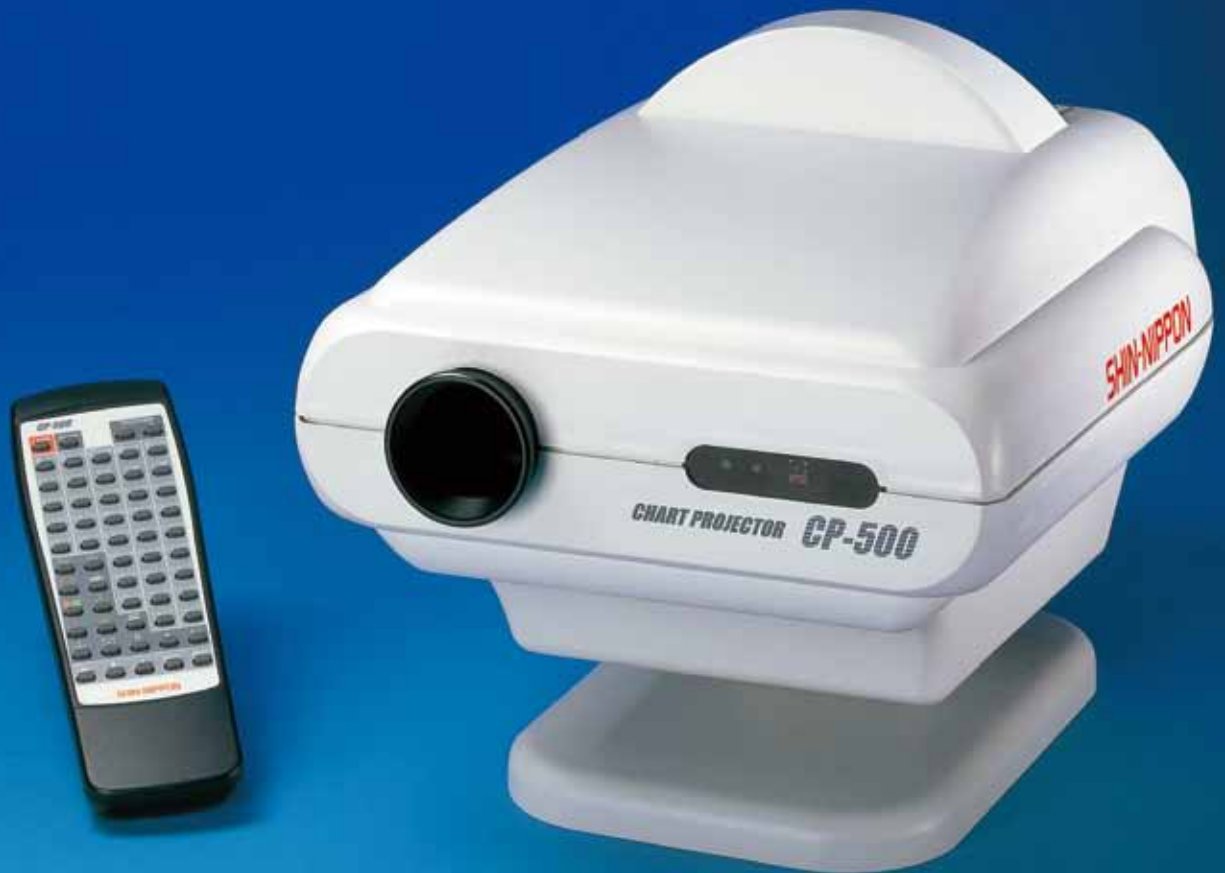
CHART PROJECTOR CP-500